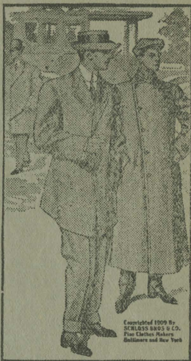
Copyrighted 1909 By STROUSS BROS & CO. Fine Clothes Makers Baltimore and New York

When you need Clothing for Men and Boys come to Lundy's Clothing Store, they handle only the best makes, and are noted for their square dealings with every one.