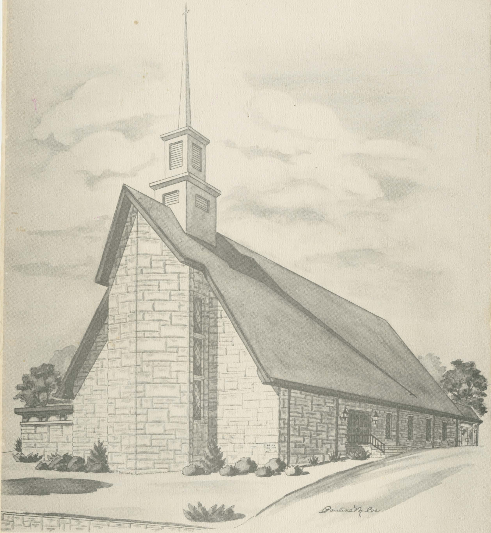
Flat Rock Baptist Church Mount Airy, North Carolina