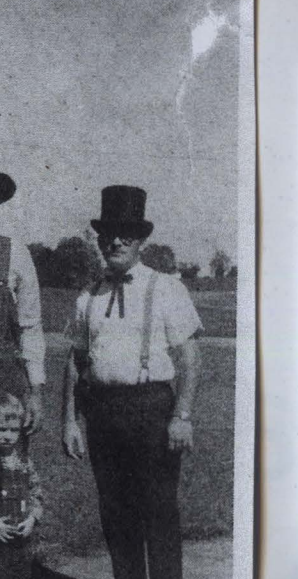
Westfield Friends Thank The Public

A spokesman for the Westfield Friends Meeting has expressed the church's appreciation to those who aided in the bicentennial celebration.