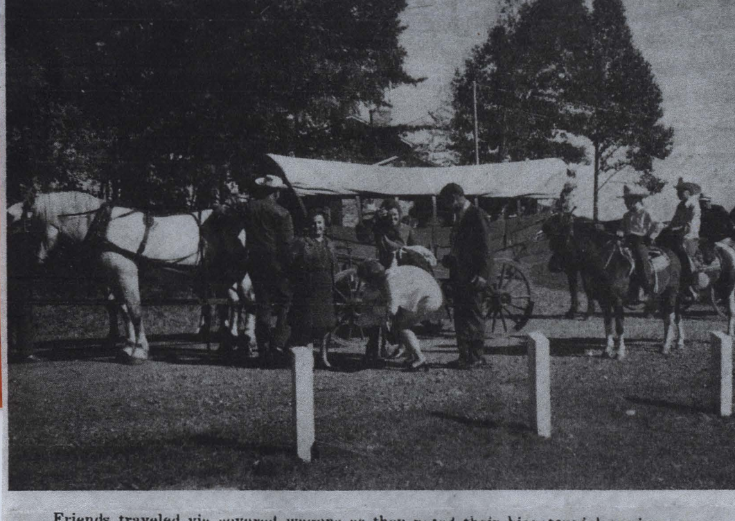
. . . Friends traveled via covered wagons as they noted their bicentennial anniversary . .

The spokesman cited the members of the Westfield Fire Department, those who furnished horses and wagons for transportation and others who assisted in the anniversary celebration.