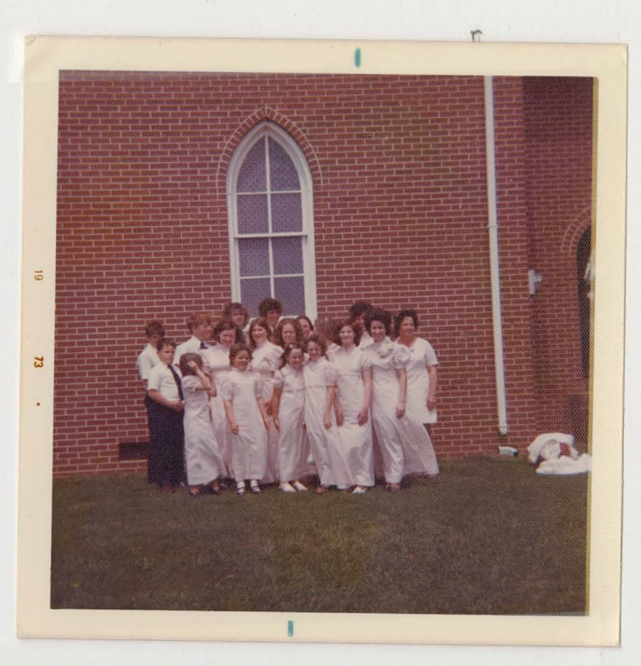
1972 – Church members built a float with a manager scene for the annual Mount Airy Christmas parade.

Children of church rode on the float in parade.