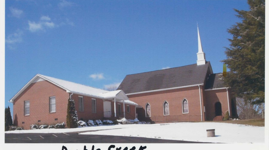
Church of Christ March 2009