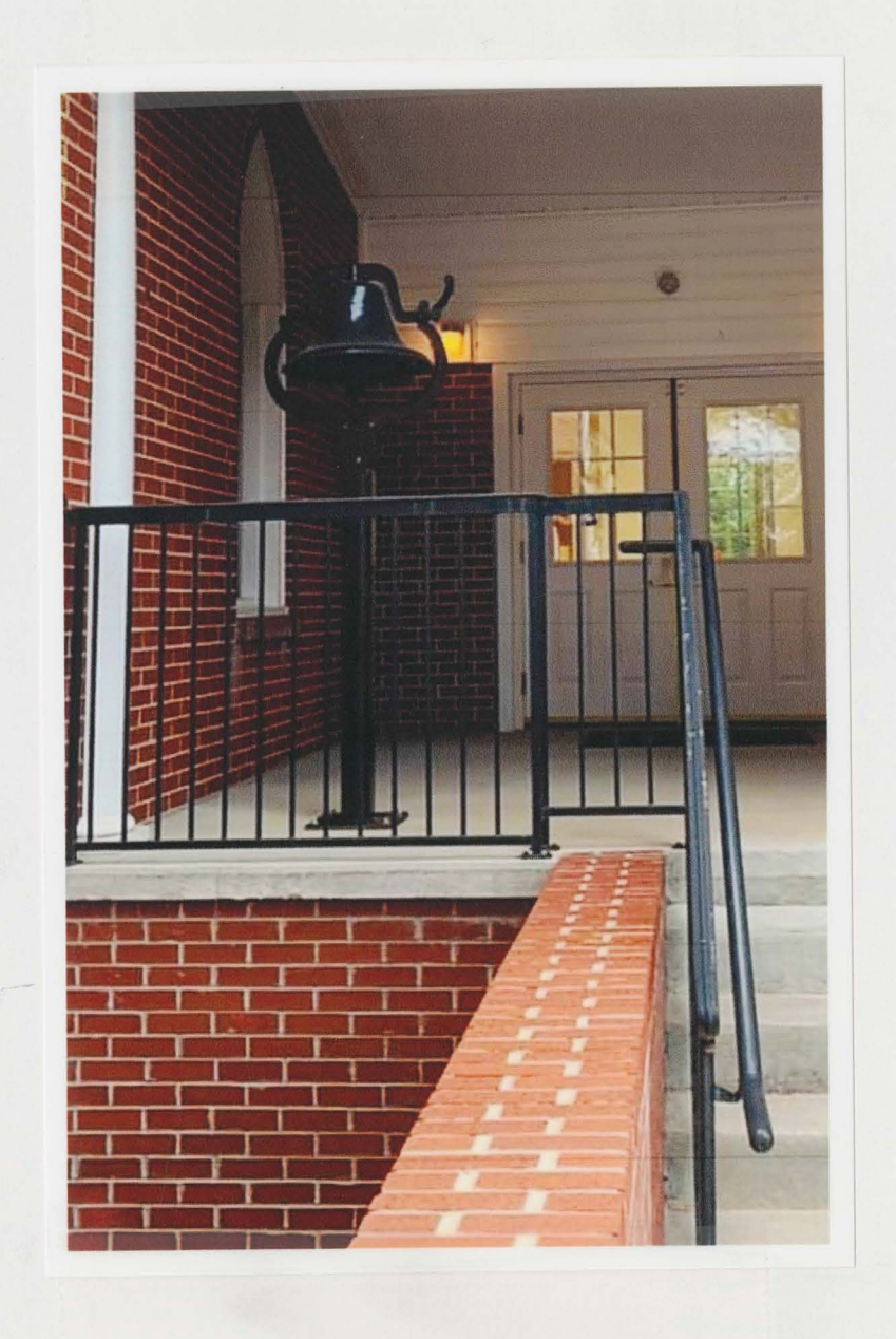
The Church Bell

Originally mounted in the building steeple was relocated to the entrance of the new fellowship hall.