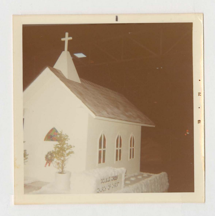
1971 – Church members built float with a miniature church for the annual Mount Airy Christmas parade. Children of the church rode on float in parade.