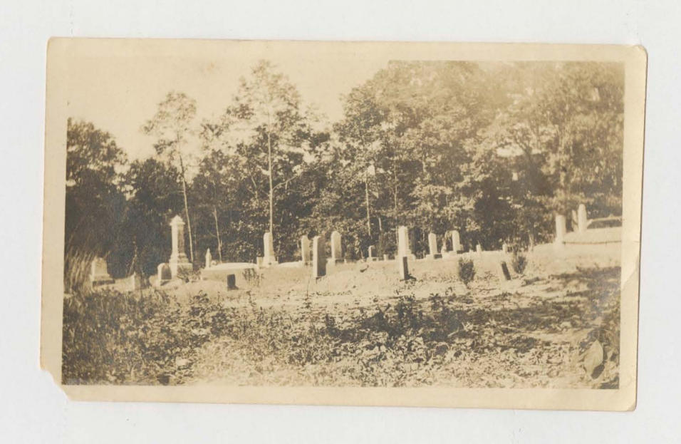
Double Creek Church of Christ Picture of church cemetery in early years after church organized.