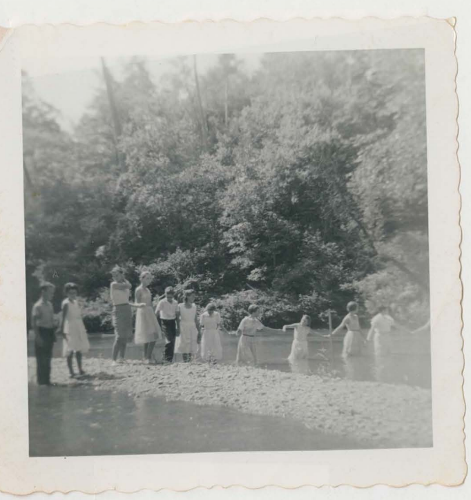
Baptism in Fisher River after Revival -Late 1950's