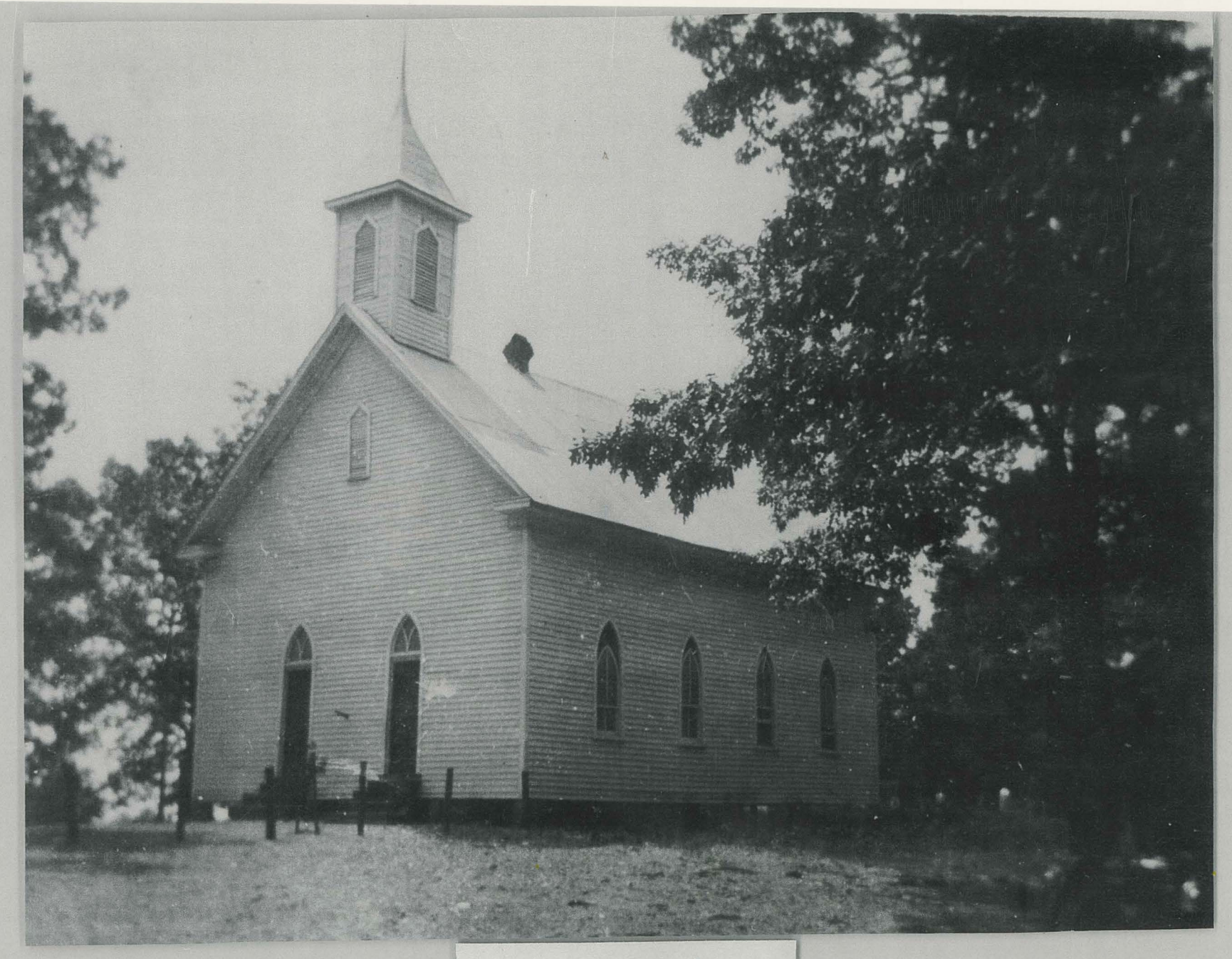
Church at Double Creek 1926