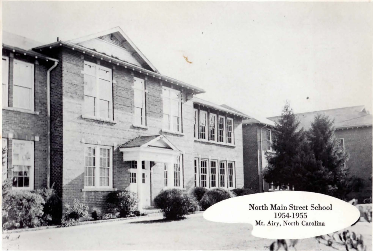
North Main Street School 1954-1955 Mt. Airy, North Carolina