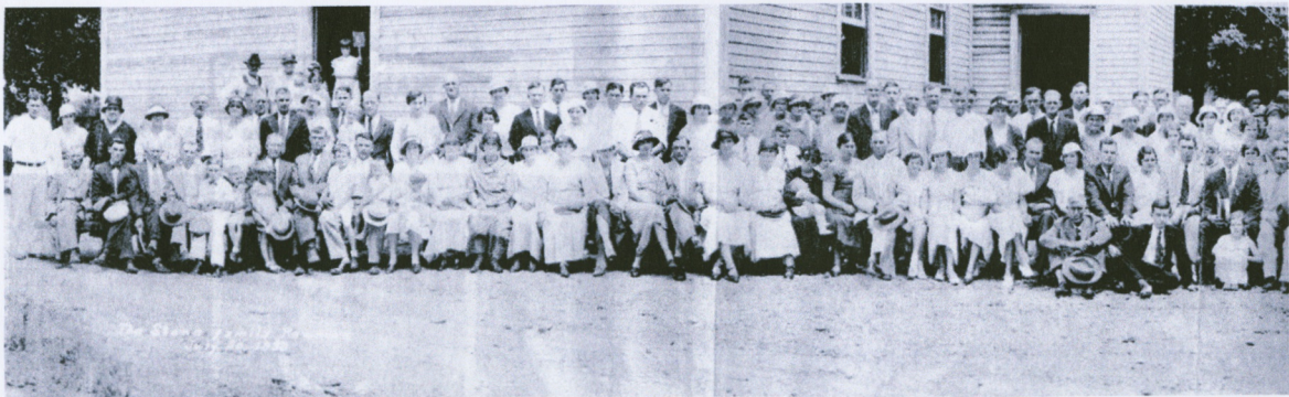
Figure 138: 1933 Stone Family Reunion in front of the Primitive Baptist Church. Notice the single door on the front of the building and the entrance on the right side.

Gabriel Osborn (Dock) Key came to Pilot Mountain from the Eldora community. He along with other interested individuals established the Pilot Mountain Primitive Baptist Church in 1896. The church building was a frame and timber construction build on the back portion of property located on the northeast corner of Main and Key Streets. The structure has undergone several changes through the years, but remains basically the same. The church originally had a bell tower that faced West Main Street. It can be seen Figure 70.