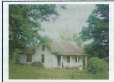
Henderson Bennett Homeplace