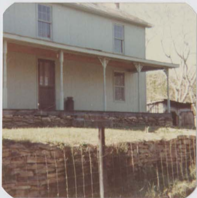
The Jacob Smith House Laurel Hole Residence Hardbank-Danbury Road Stokes County, NC Photograph 1981