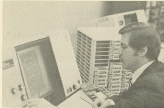
Bud busy at microfilm station

Records from 1771 are kept in a large fireproof vault and are arranged to promote maximum access and use. Three microfilm viewers and copiers are available to the public and these are easy to operate.