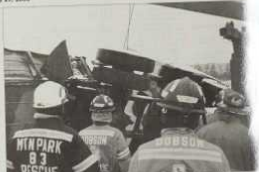
Rescue workers from across the state attended, learning how to work with wrecker services. Local volunteer Edinboro, Edinboro Park attended.