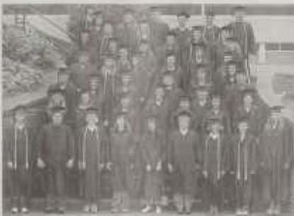
Students received their GED Diplomas at the graduation ceremony held on Sept. 26 at the Harp Community College campus.

The Student Services and Career Center (SCC) is pleased to be announcing a community GED program to help students with low literacy skills. The program is designed to help students with low literacy skills gain the skills and confidence needed to succeed in the workplace. The program is designed to help students with low literacy skills gain the skills and confidence needed to succeed in the workplace. The program is designed to help students with low literacy skills gain the skills and confidence needed to succeed in the workplace.