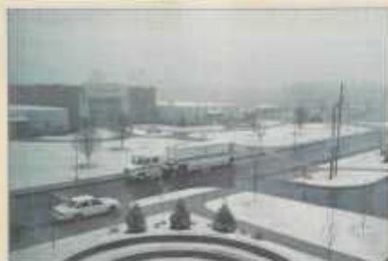
The event of February 27th felt the effects of yesterday's snowstorm, with Surry Community College improving the safety performance. Thousands of cars, snowplows, plows and tractors blanketed by the storm.