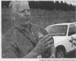
Wayne County, president of the State Council on Community College Assessment (SCC), is seen here with a group of people at the SCC campus.

The SCC is currently in the process of selecting a location for its new headquarters. The council is evaluating several options and is expected to make a final decision in the near future.