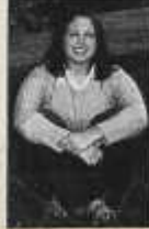
Mooney is the daughter of [Name] and [Name].

SCC courses scheduled The Shenandoah Valley Community College has announced the schedule for its courses. The college offers a wide range of programs, including business, health care, education, and liberal arts. Students can choose from a variety of majors and minors, and the college offers a variety of support services to help students succeed.