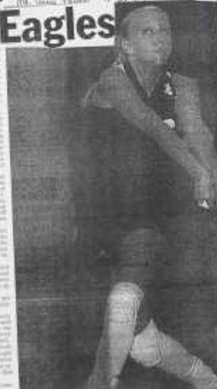
Surry Community College Knights return a pitch during the Knights' sweep against Fayetteville Technical Community College Eagles.

The Eagles will also continue to compete in the regional tournament.