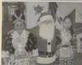
Students and staff members perform their creative costumes during the performance.