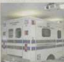
The ambulance simulator is used to teach students about the anatomy and physiology of the human body, as well as the principles of emergency medical care.

The simulator is a high-tech, interactive environment that allows students to practice their skills in a safe, controlled setting. It is used to teach students about the anatomy and physiology of the human body, as well as the principles of emergency medical care.