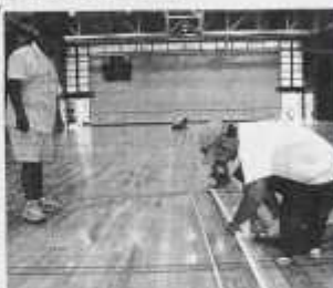
The new logo and stripes are being applied to the gym floor at Surry Community College.

The new logo and stripes are being applied to the gym floor at Surry Community College. The new logo and stripes are being applied to the gym floor at Surry Community College.