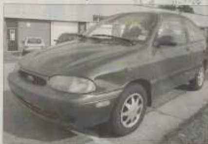
Old Red sits in the lot at Barry Community College.