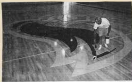
The new logo and stripes are being applied to the gym floor at Surry Community College.