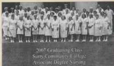
2007 Graduating Class Surry Community College Associate Degree Nursing