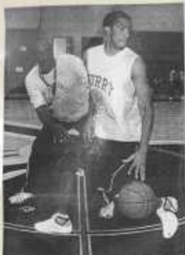
Knights players and coaches practice on the gymnasium floor. The team is preparing for the upcoming season.