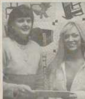
Scholarship awarded 2006 3-21-06

The class is being offered through the Surry Economic Development Partnership and the Surry Community College. The class is being offered through the Surry Economic Development Partnership and the Surry Community College. The class is being offered through the Surry Economic Development Partnership and the Surry Community College.