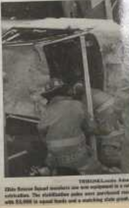
This rescue worker works on the equipment in a vehicle extraction. The hydraulic tools were purchased recently with $5,000 in grant funds and a matching state grant.