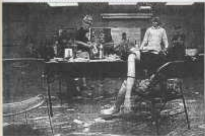
Students work together at a campsite camp of being (Continued on Page 10) The scene was set for a group of students that were the first to arrive at the campsite.