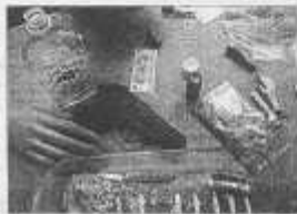
Students work on a project at a campsite camp of being (Continued on Page 10) The scene was set for a group of students that were the first to arrive at the campsite.

It's a hands-on camp for students who are interested in science, math and technology. The camp is held at the [Location] and is open to students in grades 7-12. The camp is held from [Date] to [Date] and is open to students in grades 7-12. The camp is held from [Date] to [Date] and is open to students in grades 7-12.