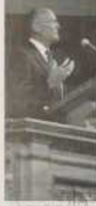
Students are being encouraged... (text describing the anti-smoking campaign)

The couple... (text about their future plans)