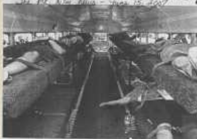
Emergency preparedness is at the heart of the United States and the University of North Carolina at Chapel Hill. This photo shows a fire drill simulation at the University of North Carolina at Chapel Hill.