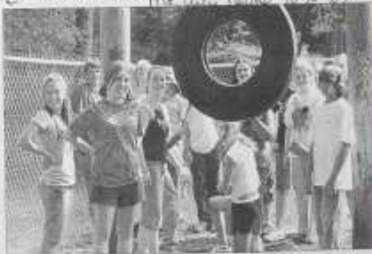
Early College students posing with a banner during activities at Kawan Point.

The Early College program is looking forward to its second year. The program provides students with a college-level education while still in high school.