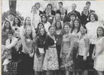
Representative of students from Terry Community College, left, and high school were awarded scholarships during Wednesday's ceremony.