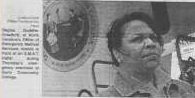
The woman is participating in a simulation exercise at the University of North Carolina at Chapel Hill.