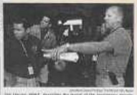
For Faculty, SCC, describes the state of the assessment resources at the University of North Carolina at Chapel Hill.