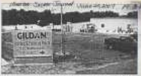
Gildan is preparing to closing its last two plants in Deeron, Mich. The photo shows a large industrial building with a sign that says 'GILDAN'.

The college is preparing for a possible increase in enrollment as a result of plant closings in the area. The college is preparing for a possible increase in enrollment as a result of plant closings in the area.