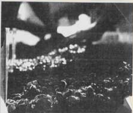
Students at SCC's Viticulture Center pick out the best grapes for the harvest. The grapes are put through a de-stemming process.

During the marketing efforts will be provided. Students who are interested in the program should contact the director of the program. The center is now open to the public and is a major step in the expansion of the program at Berry College. The center is now open to the public and is a major step in the expansion of the program at Berry College.