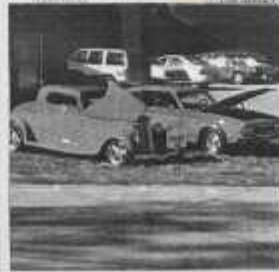
Massachusetts 11-7-07 SCC's Center for Tobacco-Free Living shows 90 cars of all types. The event was sponsored by the Corporate and Continuing Education, Personnel and the Auto Body and Auto Tech Programs and the Campus Police Department.