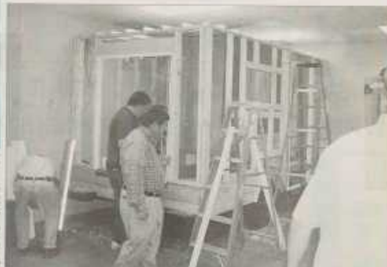
Workers work on the interior of the ambulance simulator in a classroom at Berry Community College's Emergency Medical Training Center.

The class is designed to provide students with the knowledge and skills needed to successfully operate an eBay store. Topics include creating an eBay account, listing items, and handling transactions.