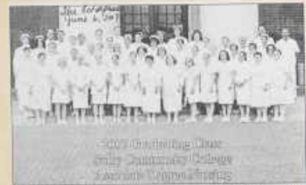
Class of 2007 photo. The photo shows a large group of people, likely students and faculty, standing in front of a building. The photo is labeled 'The Class of 2007'.

The drill, which will involve the presence of an all-hazards drill, the Deeron University emergency response team will be trained by faculty and staff.