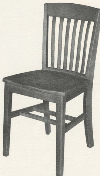
No. 16234 CHAIR Seat: W 18½", D 16". Height of back above seat: 17½". Shipping weight: 17 lbs. Finishes: Walnut or Mahogany. Available in Light Oak or School Furniture Brown finish as No. 11010.