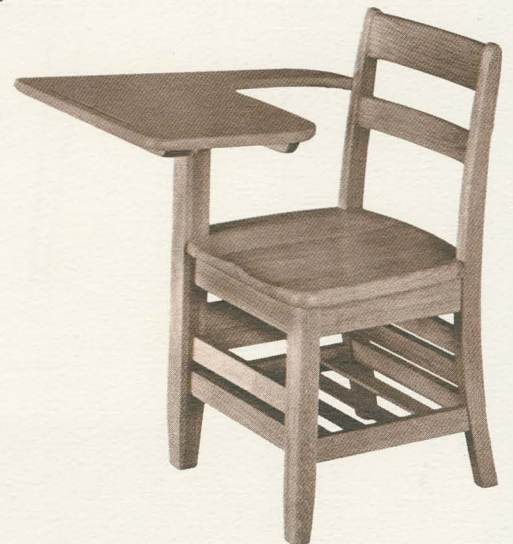
No. 176-A CHAIR DESK Made of Oak with a seat from 5/4" stock. The writing arm is made of Hard Maple. Double dowel construction is used, back posts are steam bent and all edges are carefully rounded. Heavy corner blocks are glued and screwed into all four corners. Standard finishes are Natural and School Furniture brown.