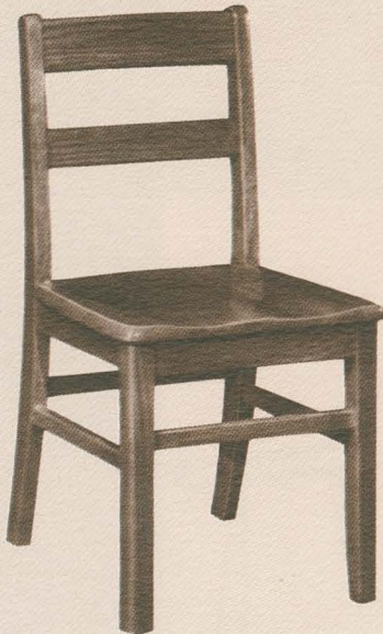
No. 6 CHAIR Seat: W 17", D 16", Hgt. 17" or 18". Hgt. of back above seat: 16". Shipping weight 18 lbs. Made of Oak or Beech. A double dowel construction is used along with corner blocks that are glued and screwed to the seat rails in all four corners. Back posts are steam bent and all edges rounded. Standard Finishes: Natural and School Furniture Brown. Available with 12", 14", and 16" seat heights — see price list.