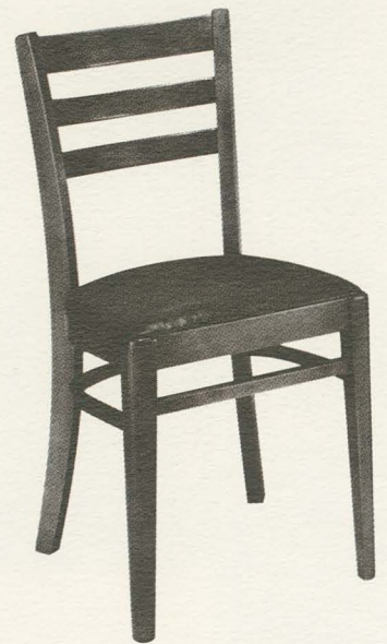
No. 380 CHAIR (Upholstered Seat) Seat: W 16¼", D 15¾", Overall Height 32". Made of Oak or Beech Wood. Standard Finishes: Maple, Walnut, Mahogany, Light Oak, Dark Oak.