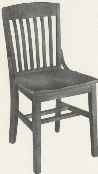
No. 16234 BA CHAIR Seat: W 18½", D 16". Height of back above seat: 17½". Shipping weight: 17 lbs. Finishes: Walnut or Mahogany. Available in Light Oak or School Furniture Brown finish as No. 11010.