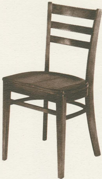
No. 370 CHAIR Seat: W 17", D 16½", Overall Height 32". Made of Oak or Beech Wood. Solid Saddle Seat. Standard Finishes: Maple, Walnut, Mahogany, Light Oak, Dark Oak.