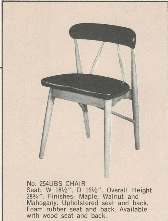
No. 254UBS CHAIR Seat: W 18½", D 16½", Overall Height 28¾". Finishes: Maple, Walnut and Mahogany. Upholstered seat and back. Foam rubber seat and back. Available with wood seat and back.