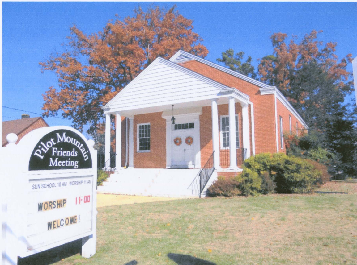
Figure 140: Pilot Mountain Friends Meeting, 2012.

Construction on a new brick meeting house was begun in 1956 and dedicated on 22 September 1957. In 1964, the Friends built a modern brick parsonage on Spring Street. It was sold to Esker Wilmoth in 1985.