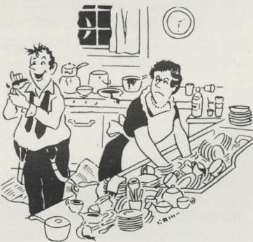
"Gosh . . . That was fun! I invited them all back next Saturday night."