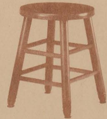
#36 - ROUND TOP STOOL (Burnished Oak Finish) Solid Oak, 13" Diameter Top 18" Seat Height Swivel Glides Packed 2 Per Carton, Weight 20 Pounds