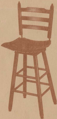
#1848 - SWIVEL BAR STOOL (Burnished Oak Finish) 24" Seat Height, Swivel Glides Packed 2 Per Carton, Weight 35 Pounds