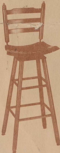
#1860 - SWIVEL BAR STOOL (Burnished Oak Finish) 30" Seat Height, Swivel Glides Packed 2 Per Carton, Weight 38 Pounds