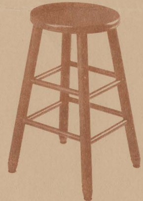
#48 - ROUND TOP STOOL (Burnished Oak Finish) Solid Oak, 13" Diameter Top 24" Seat Height Swivel Glides Packed 2 Per Carton, Weight 23 Pounds