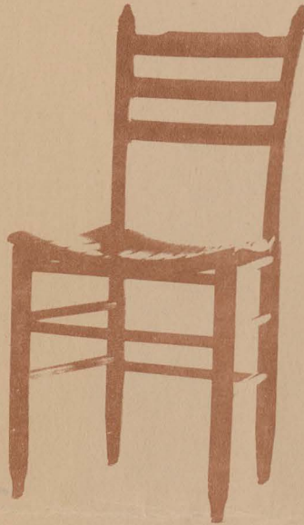
#1802 - CHAIR (Burnished Oak Finish) Equipped with Rubber Cushion Glides Packed 2 Per Carton, Weight 25 Pounds 10 Stretchers for Strength 3 Shaped Splats in Back Seat 17" x 14" Overall Height