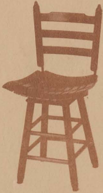
#1836 - SWIVEL BAR STOOL (Burnished Oak Finish) 18" Seat Height, Swivel Glides Packed 2 Per Carton, Weight 30 Pounds