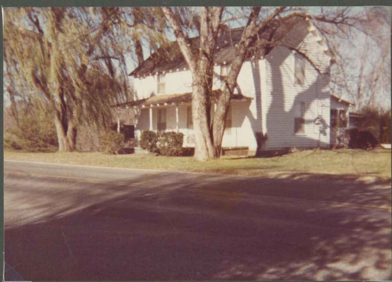
Hardbank - Mother was born in a small log house just behind this one which later became the kitchen connected by an open porch to the new house.