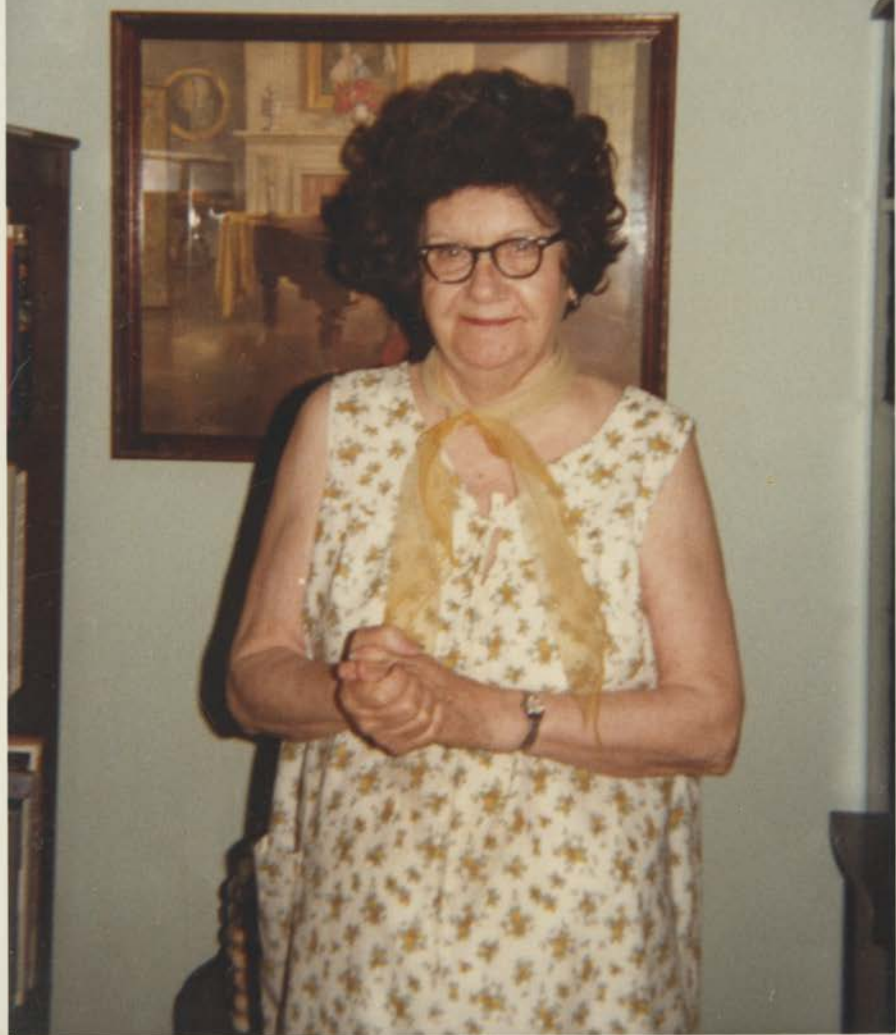
Second Street, Winston-Salem This is Mother in front of her favorite picture, again on her birthday.