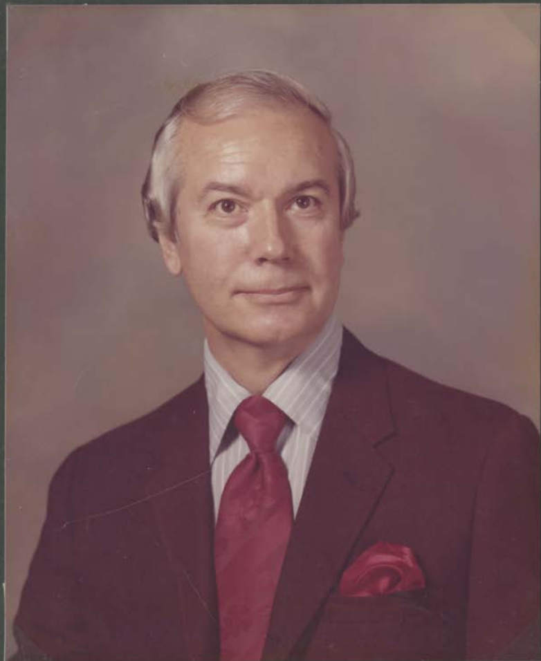
Winston-Salem - This picture of myself was taken at "The Portrait Place" on March 4, 1982, age 50.