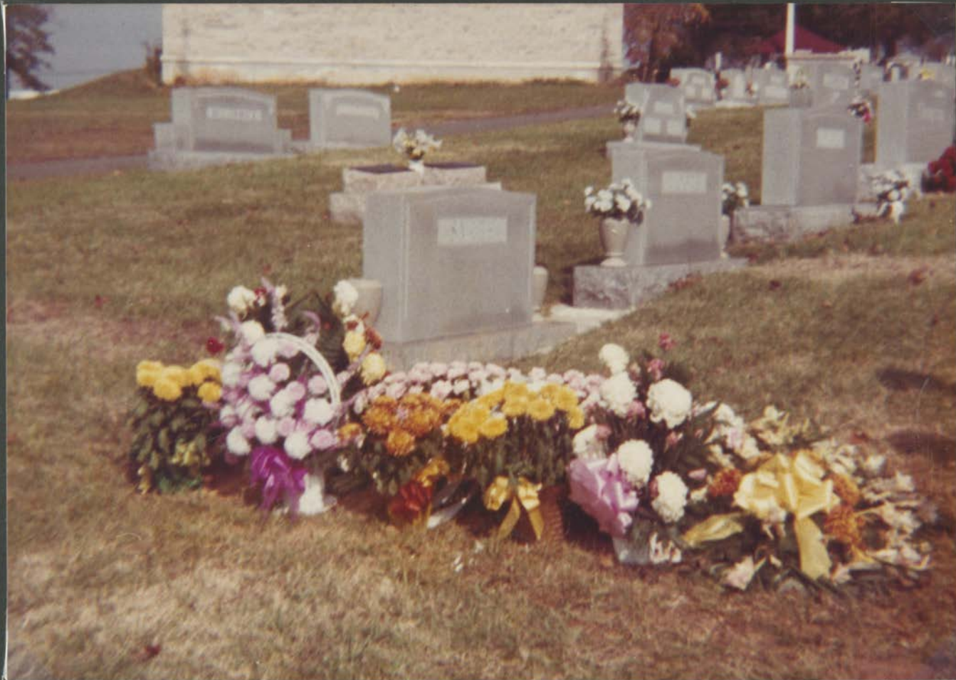
Pilot Mountain - This is Mother's grave in the City Cemetery. The picture was taken on Nov. 3, 1981.