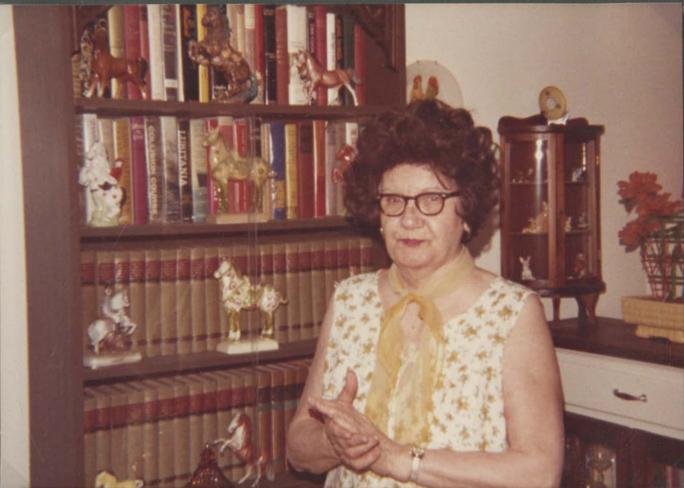
Second Street, Winston-Salem This picture of Mother was taken on her last birthday, January 11, 1981. She was 82 years of age.