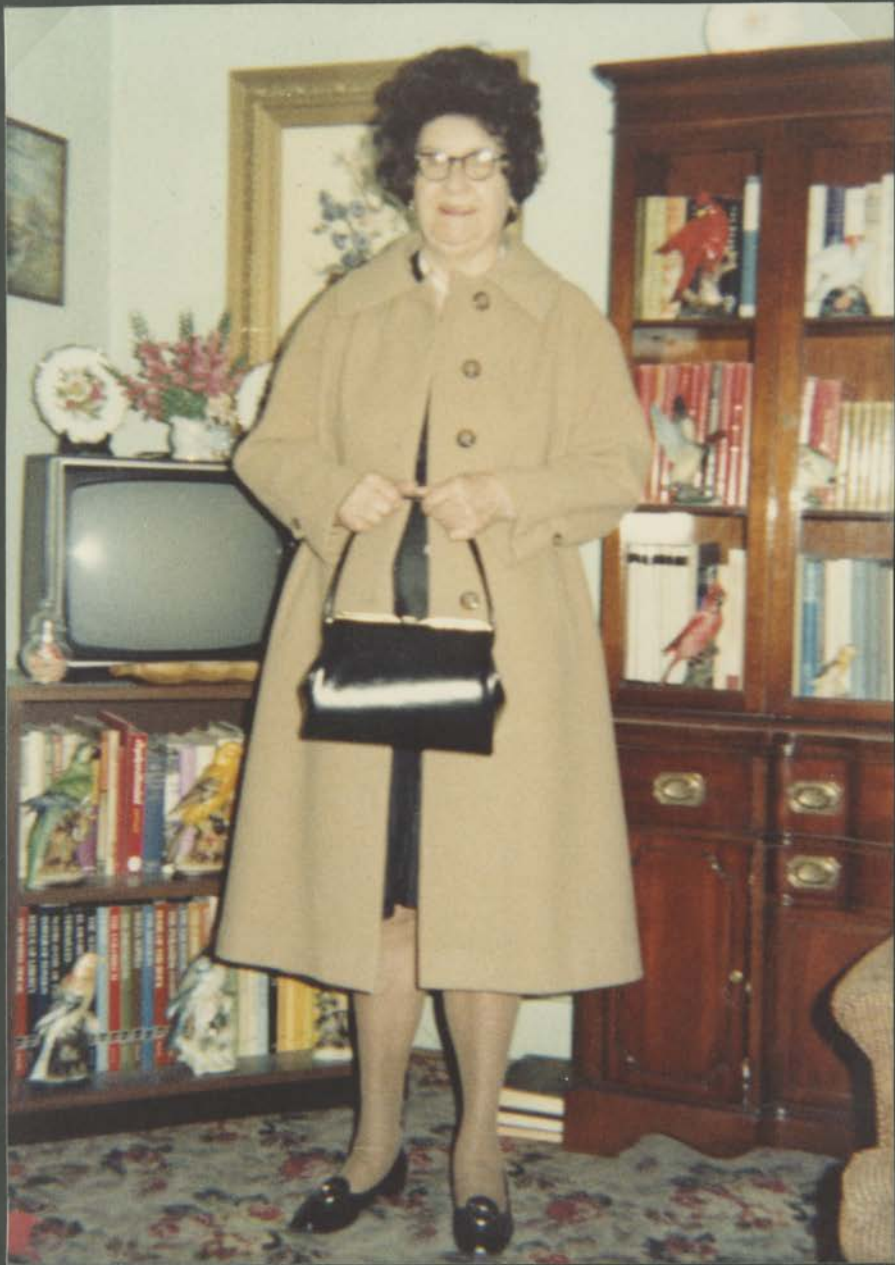
Second Street, Winston-Salem Mother was very proud of her new overcoat which she is wear- ing here on January 16, 1981.