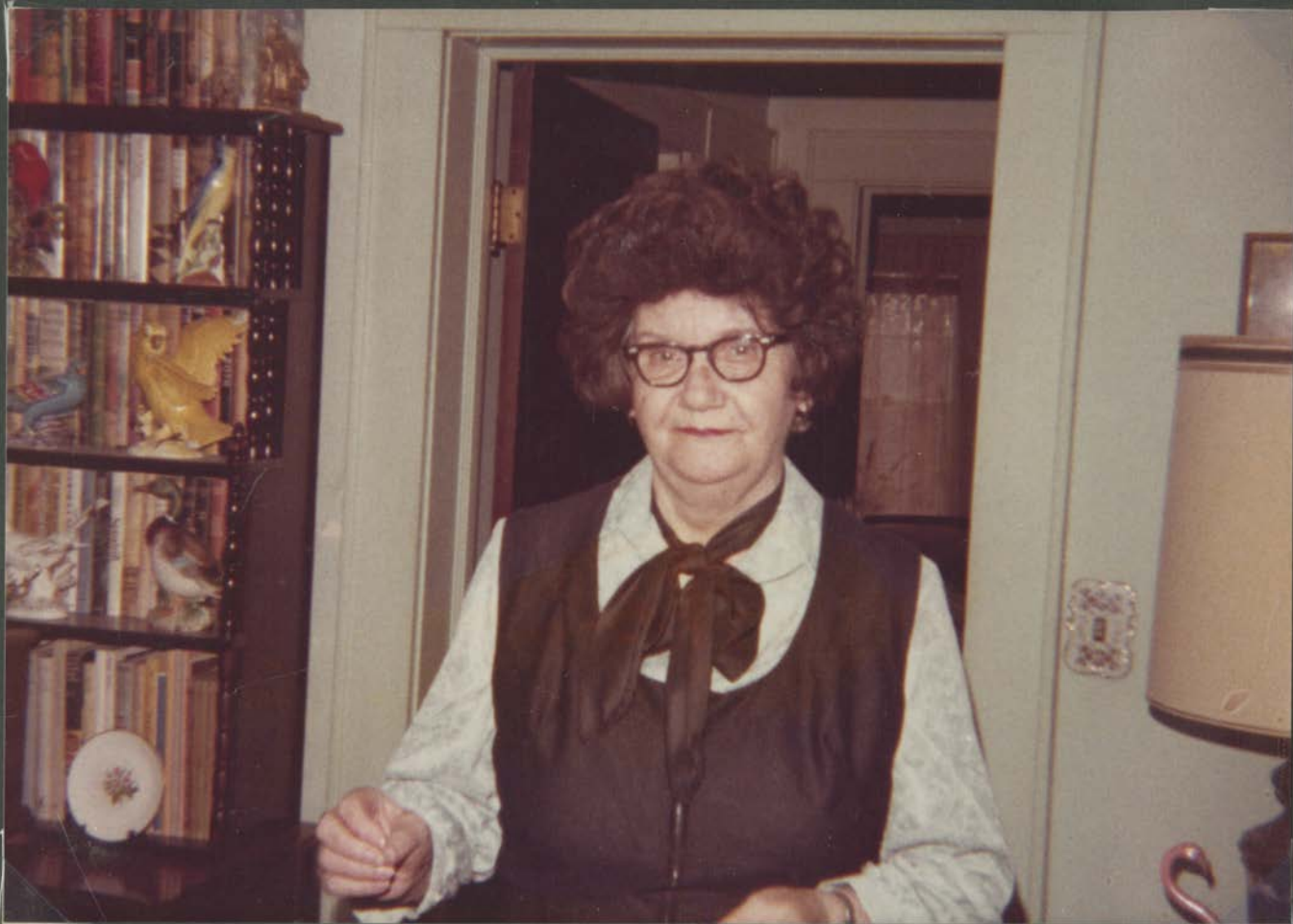
Second Street, Winston-Salem This picture is of Mother in late winter or early spring 1981, and it was the last one taken of her while well.