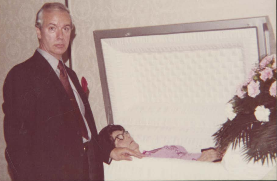
Pilot Mountain - Cox Funeral Home I myself am seen by Mother's side shortly before the closing of the casket. Gladys took this photo. The spray matches Mother's robe.