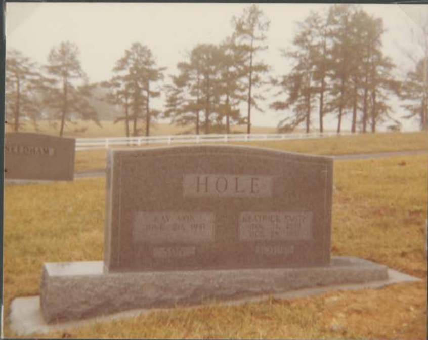
Hole Tombstone Pilot Cemetary Erected 11/25/1981 (Photo 12/2/1981)