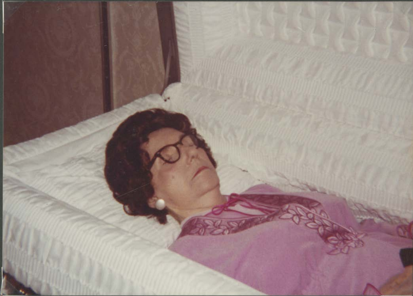
Pilot Mountain, Cox Funeral Home This picture of Mother was taken during the family hour just prior to the graveside service, October 28, 1981.