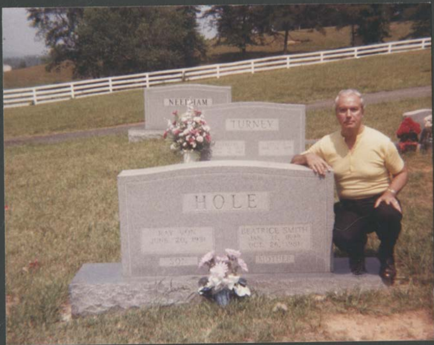
Ray Von Hole Pilot Cemetery July 5, 1986