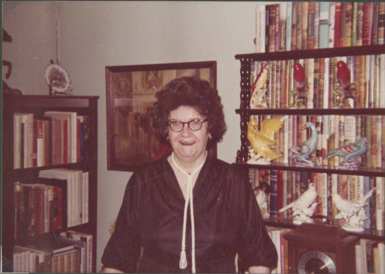
Second Street, Winston-Salem Mother is shown here on January 16, 1981.