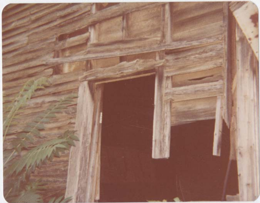
Hardbank School Stokes County, NC Smiths and Holes were teachers and students (Photo 7/18/1982)