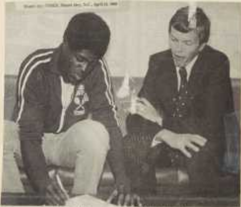
Assisted Sign Grant-to-Aid With WSSU

Surry Community College will hold an open house on Sunday, August 17, 1980. The open house is a special opportunity for the public to view the college's facilities, meet with faculty and staff, and learn more about the college's programs and services. The open house is a free event and is open to all interested parties.