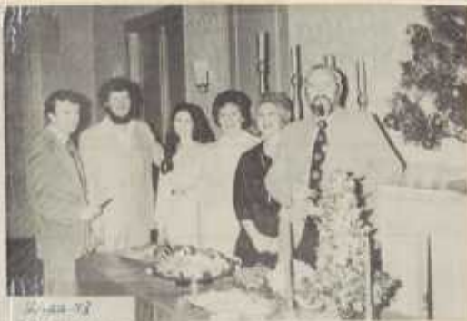
18 - The Most Joyous: Aurry Community College family members