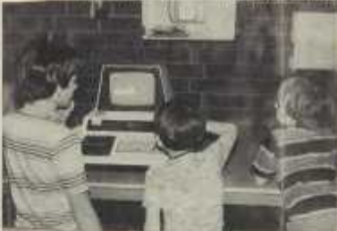
Computer display attracts young audiences.

March 24th 1978, Monday 12:15, Page 3, 1978