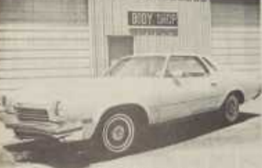
1974 Buick & part of training program

The body shop at Berry Community College is very popular with students.