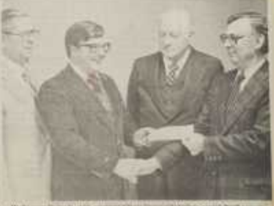
...of the Knights... ...of the Knights... ...of the Knights...