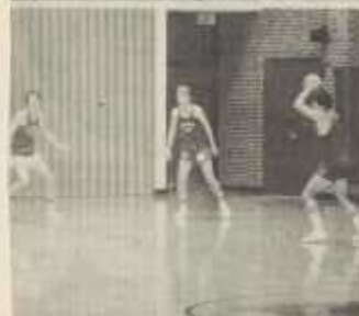
Learning The System