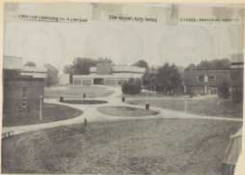
Surry Community College in Dobson