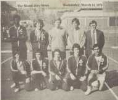
Surry Community tennis team

The team will play its first game on Oct. 4 against the Wake County team.