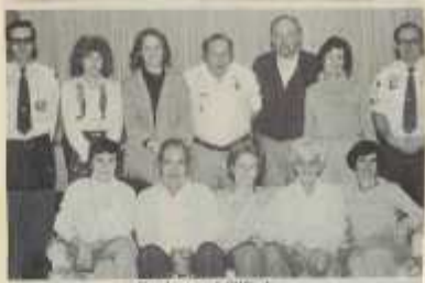
Graduates of CPR class

The Mason City News, Friday, February 16, 1979