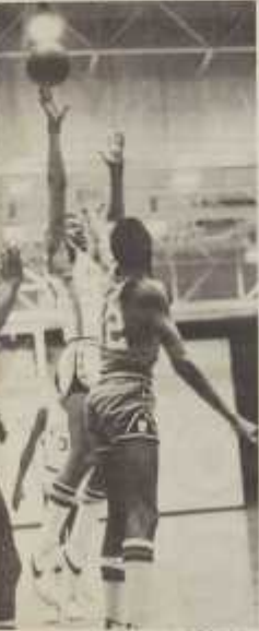
A view-obstructing hand

FERRIS —The "I" and "S" of the game were the Ferris team's victory over Surry in a game which was a very close contest. The game was a very close contest, and the Ferris team led by 10 points in the fourth quarter.