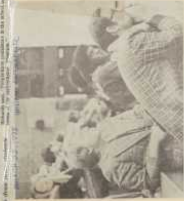
Students in vocational courses

The first year of progress with enrollment, 1978, the year of the largest graduating class, 1977, and the year of the first vocational courses, 1977, are the milestones for the college's first year.