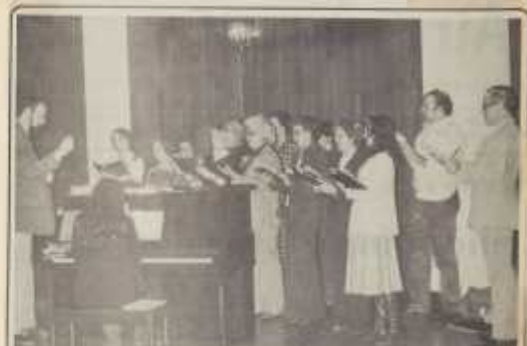
Choir performing at a church service.