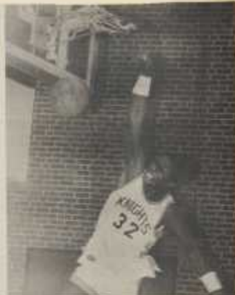
Wings are steady the ball after a shoot.

Surry coach said the defense and offense were "well-balanced" in the second half.