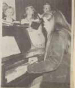
Choir performing at a church service.

Choir members performing at a church service. The choir sang several Christmas carols, including "Silent Night" and "O Little Town of Bethlehem." The service was held at the local church.