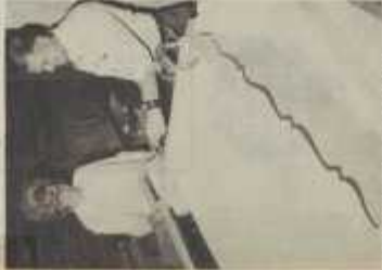
Vocational courses continue

The first year of progress with enrollment, 1978, the year of the largest graduating class, 1977, and the year of the first vocational courses, 1977, are the milestones for the college's first year.