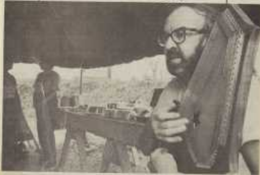
Work and education combined created the quality of Student Body's Best Computer. The machine will soon offer the use for the user. The new price will only cover the cost of the machine.