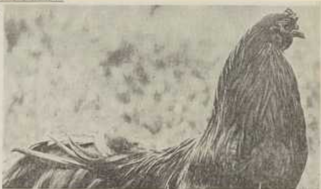
Here is the most handsome of Black Gamecock cocks, proudly bearing watch over his hens in the breed's pride.

He will show off his tail feathers to the best advantage. He will show off his tail feathers to the best advantage. He will show off his tail feathers to the best advantage. He will show off his tail feathers to the best advantage. He will show off his tail feathers to the best advantage.