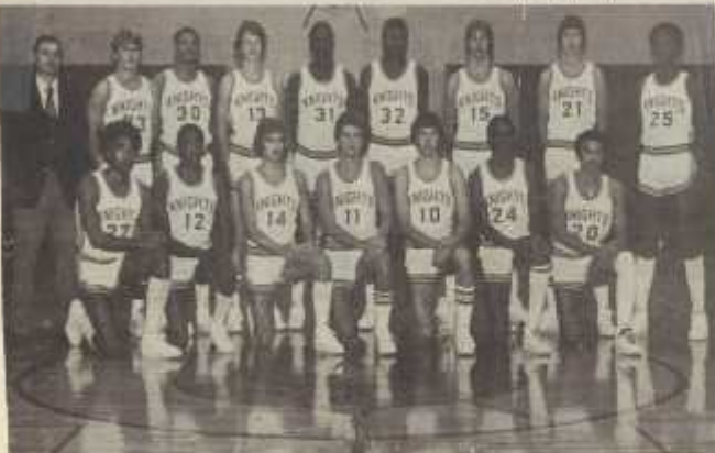
The 1979-80 edition of the Surry Community College Basketball team poses in recent night at 7:30 in Durham.