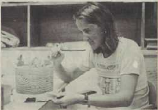
"I work on my own sculpture whenever I can, ... Either here or at home."