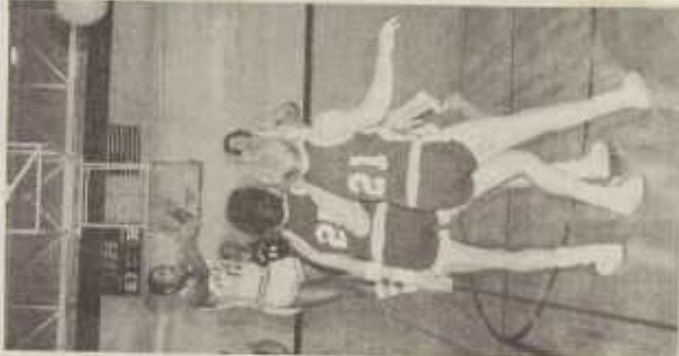
Fuller's shot from the game on Feb. 1, 1969.