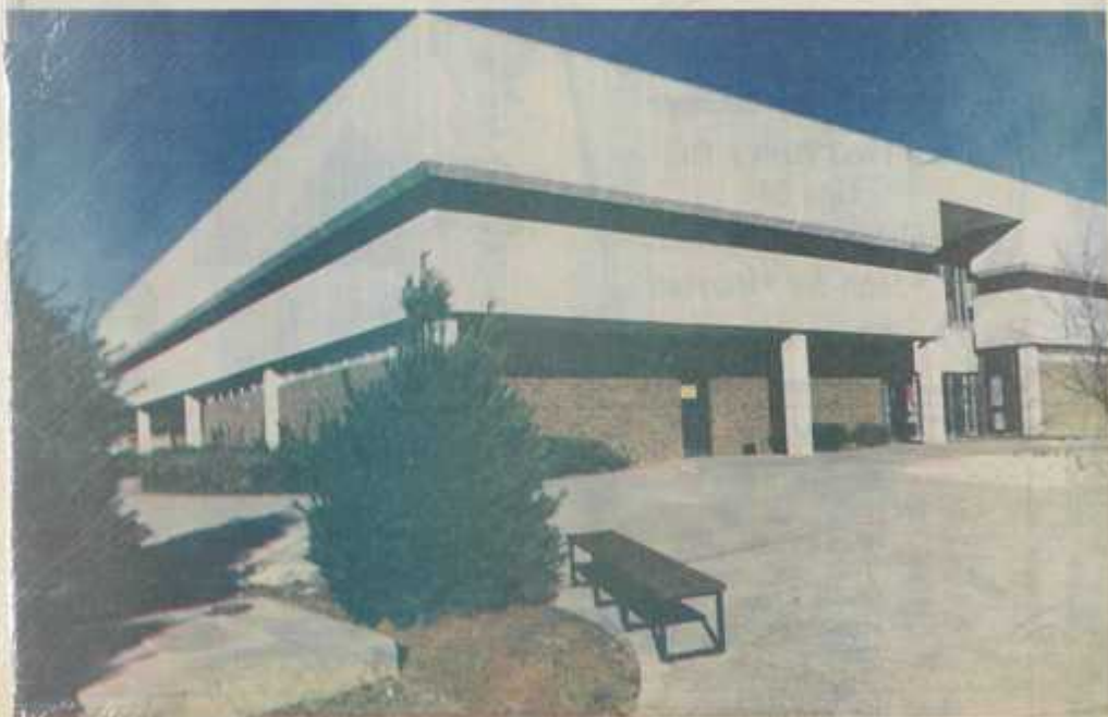
$1 million learning center will be added to college campus by 1979