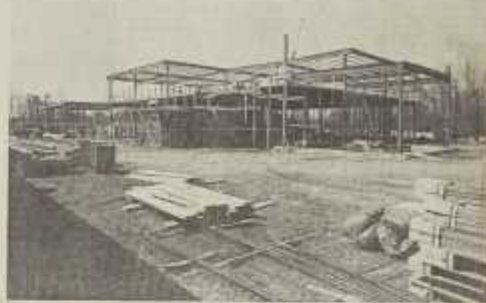
New building of Surry Community College will house the school's offices.

The building, which is being built on the site of the former Dobson Building, will house the college's administrative offices, and will be completed by the end of the year.