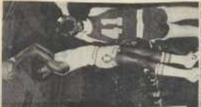
Surry Community basketball player (left) jumps for a rebound during a game. (Right) Davidson Community College player jumps for a rebound.

Surry's record is 2-1 and Davidson's is 1-1.