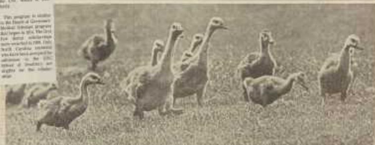
The birds' colors were born with the next generation. In this view, it's a young flock of several thousand peacocks awaiting sunrise in the lowlands.

WHEELER-JOURNAL WEDNESDAY, JULY 23, 1980