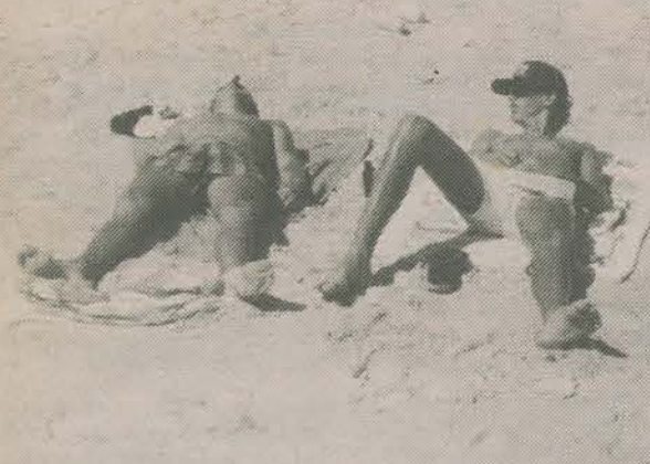
This beach bum scopes out the women as his friend recovers from a late night.