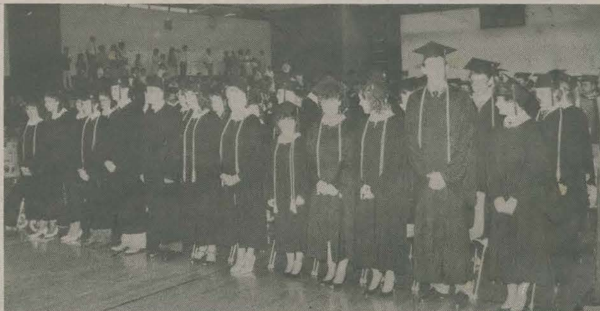
265 Associate of Arts, Associate of Science, and Associate of Applied Science candidates prepare to receive their degrees in the SCC gymnasium Friday night, May 29, at 6:30 p.m.