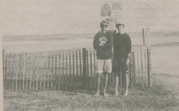
Who wouldn't love to be "stranded" on a deserted island with these two college men?