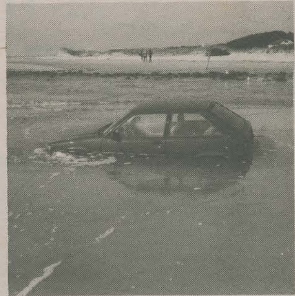
Were these people luckier than those who received tickets in Mayberry Mall?

The fun-filled day ended with the annual Spring Dance with music again from "Sound Approach." Students, faculty, staff, and alumni were dressed in their "Sunday's Best" as they danced the night away. With the theme "Tropical Paradise," decorations included palm trees, tropical birds, a vine-covered lattice background for photographs, a vivid island mural, and various plants and flowers.