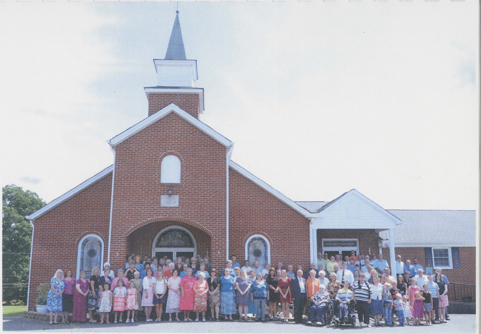
Walking In His Light