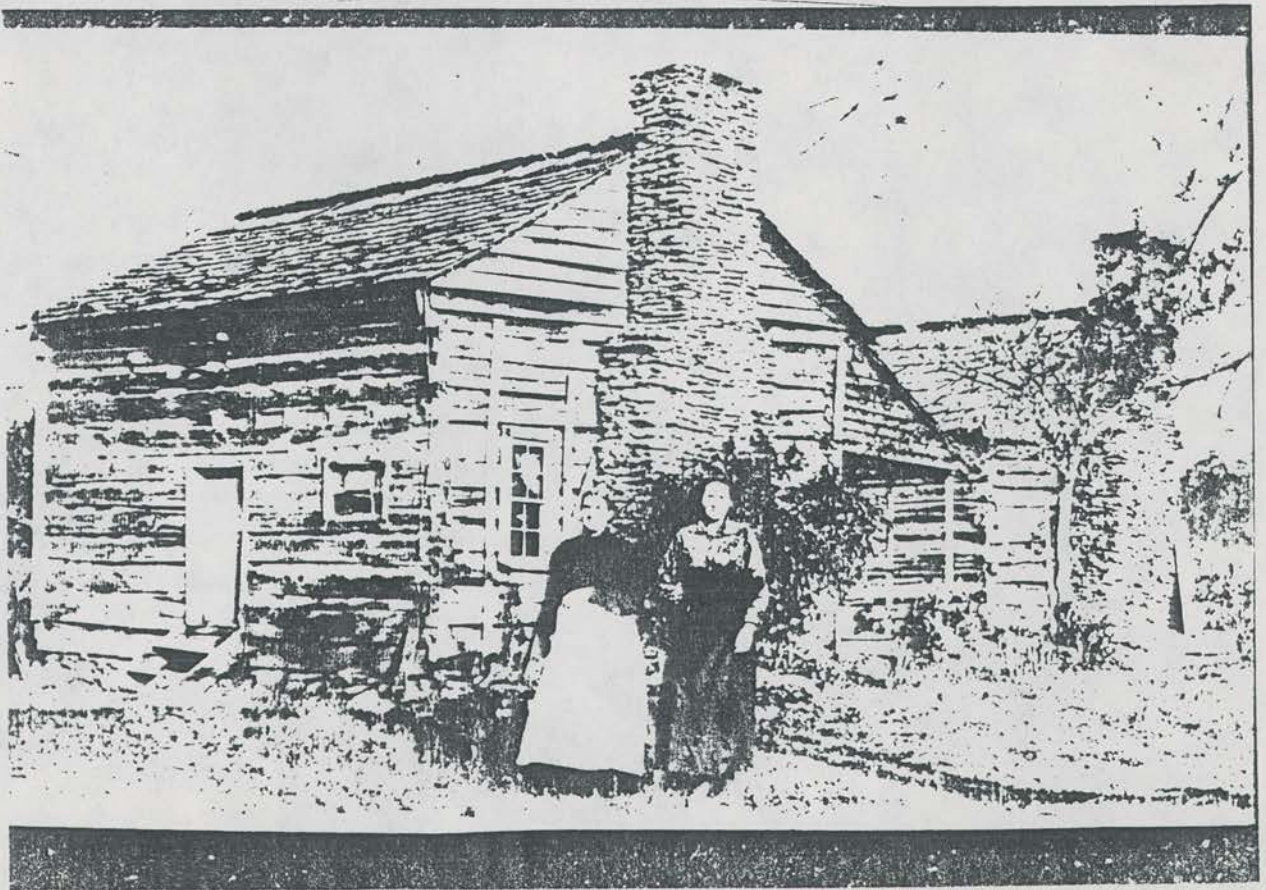
Smith homeplace ca 1915 Grannie & Aunt Rose

Front of house begun back of house when road was changed + kitchen part of house taken off -