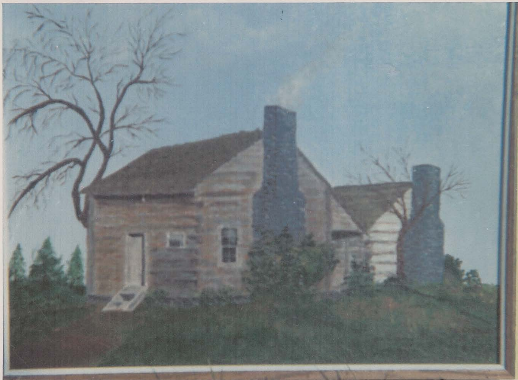
a painting of a picture of SMITH HOMEPLACE before old kitchen was removed